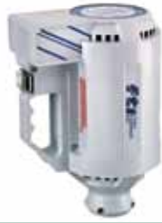
TEFC (M7T, M8T)