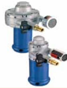
Air (M6, M6X)